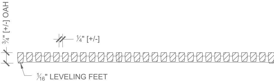
Cross Section Scale: 3" = 1' 0"